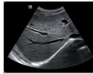
Liver with ascites