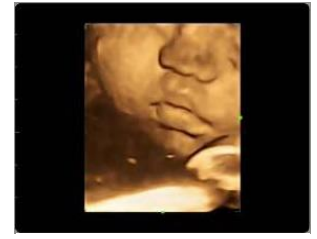
3D Fetal Mouth